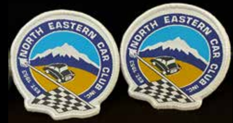
Cloth Badges – $5