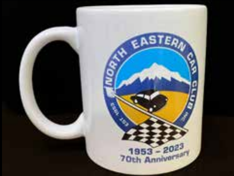
Coffee Mugs – $10