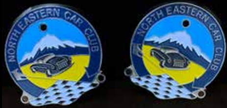
Metal Grille Badges – $25