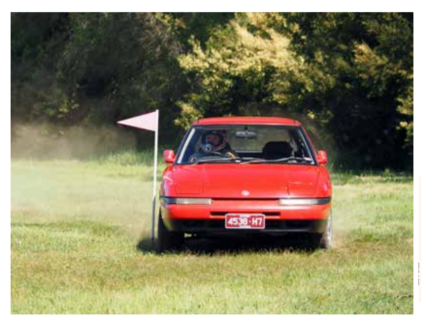
17th September 2023 Round 3