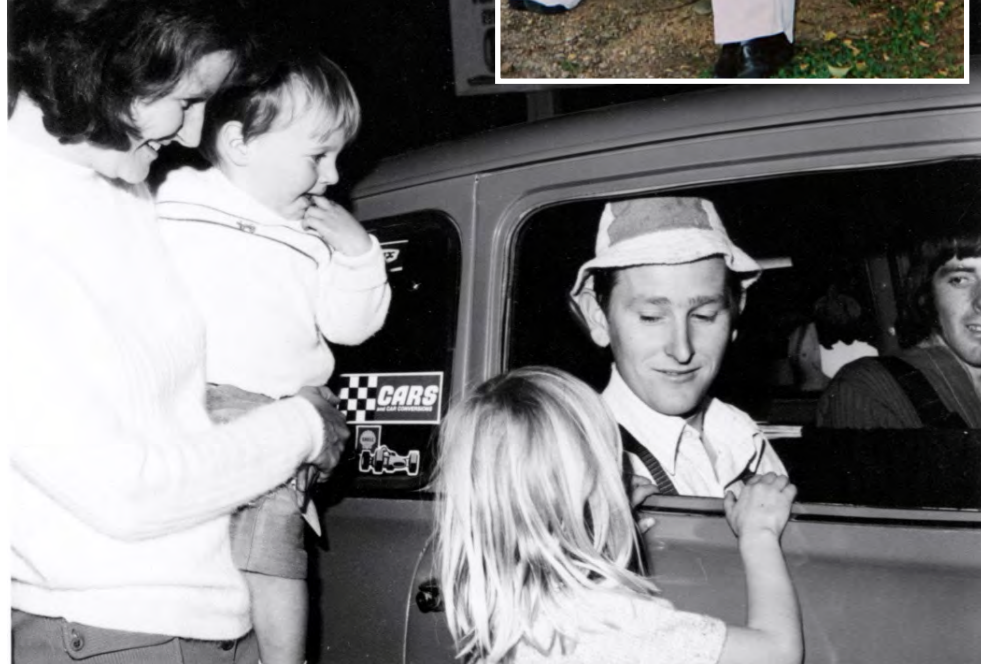
THE GOOD OIL