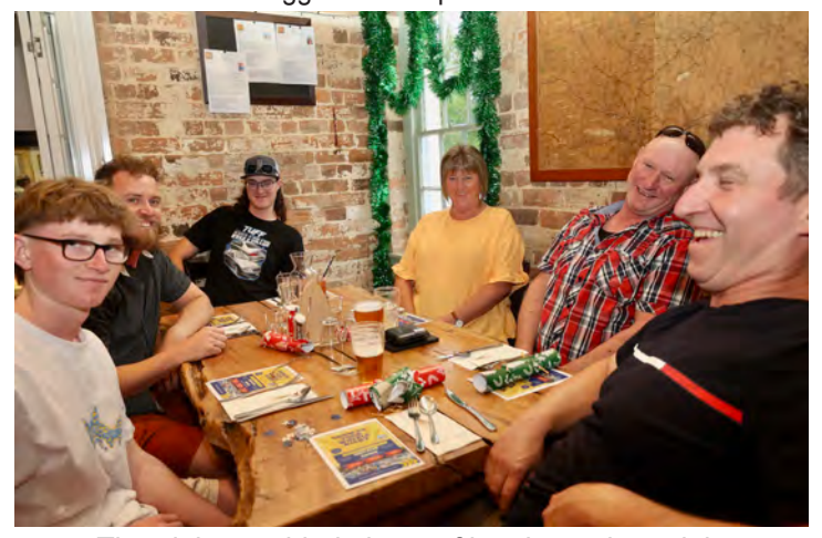
The night provided plenty of laughs and good times