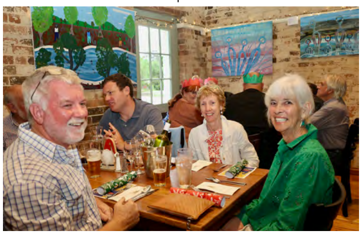
The Kaitlers and the Harpers catch up