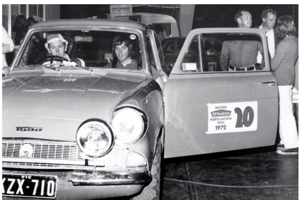
THE GOOD OIL