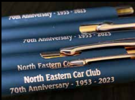
Pens – $2