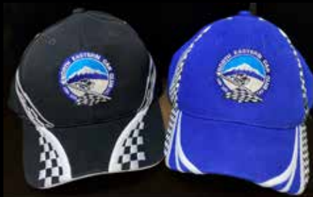
Club Caps – $25