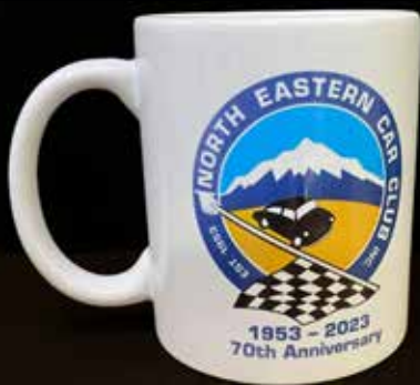
Coffee Mugs – $10