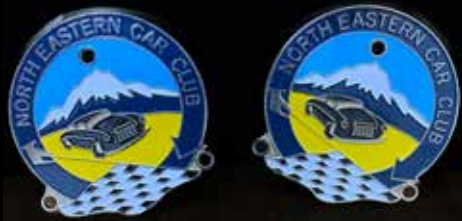
Metal Grille Badges – $25