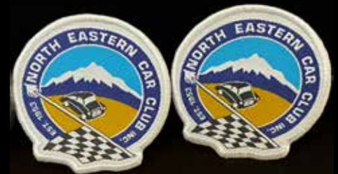
Cloth Badges – $5