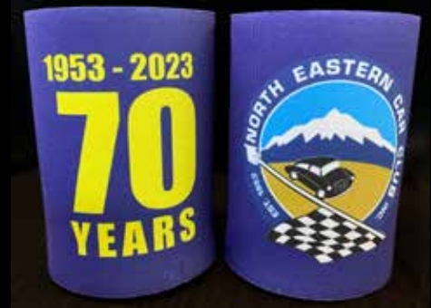
Stubby Holders – $10